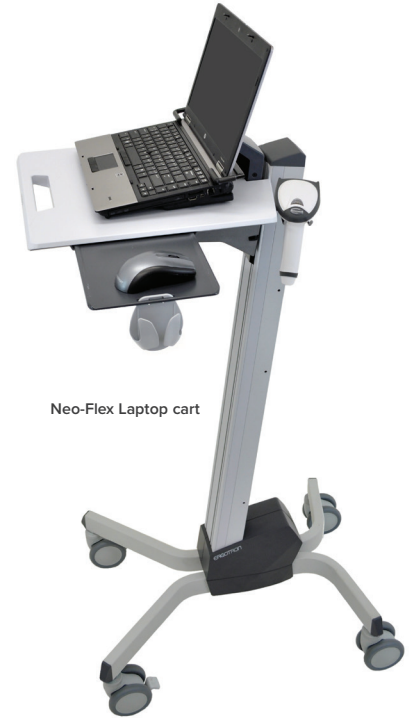
Neo-Flex Laptop cart