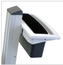
NF CART HANDLE AND BASKET KIT 97-545 (GREY)