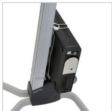
UNIVERSAL CPU HOLDER 80-105-064 (DARK GREY)