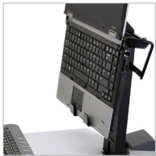
NF CART LAPTOP VERTICAL KIT 97-546