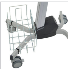
NF CART WIRE BASKET KIT 97-544