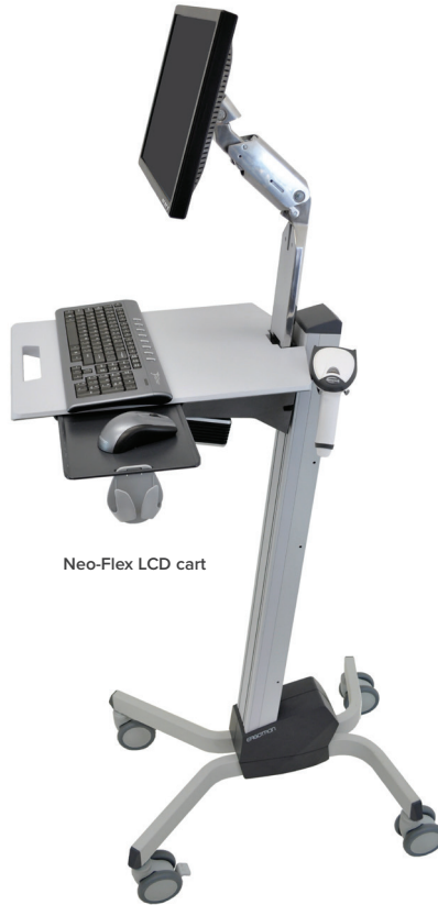
Neo-Flex LCD cart